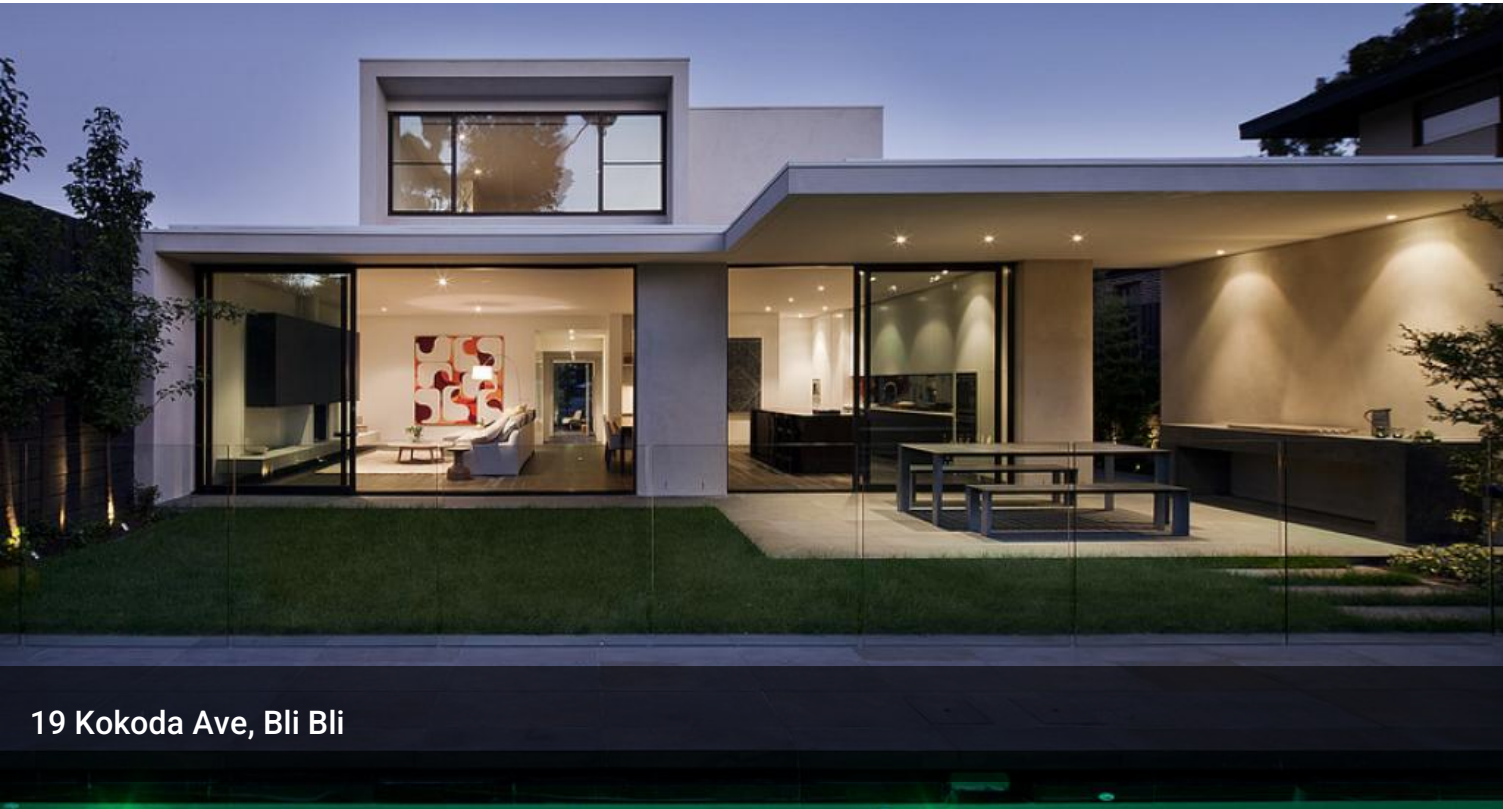
19 Kokoda Ave, Bli Bli